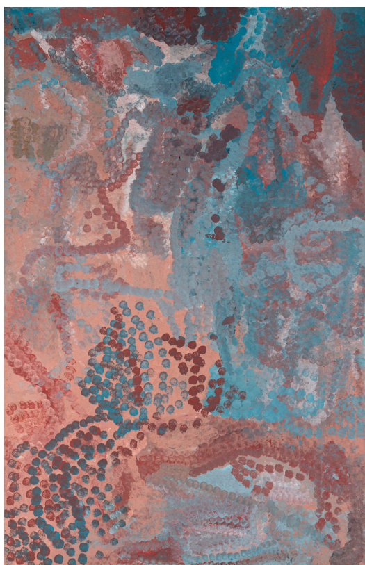
10. EMILY KAM KNGWARRAY | Untitled - Alhalkere 1993 SOLD by Private Treaty to a Prominent Private Collection in Switzerland by D'Lan Contemporary