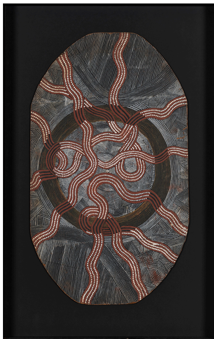
8. CLIFFORD POSSUM TJAPALTJARRI | Untitled - Snake Dreaming 1972

SOLD by Private Treaty to a Private Museum in the United States of America by D'Lan Contemporary