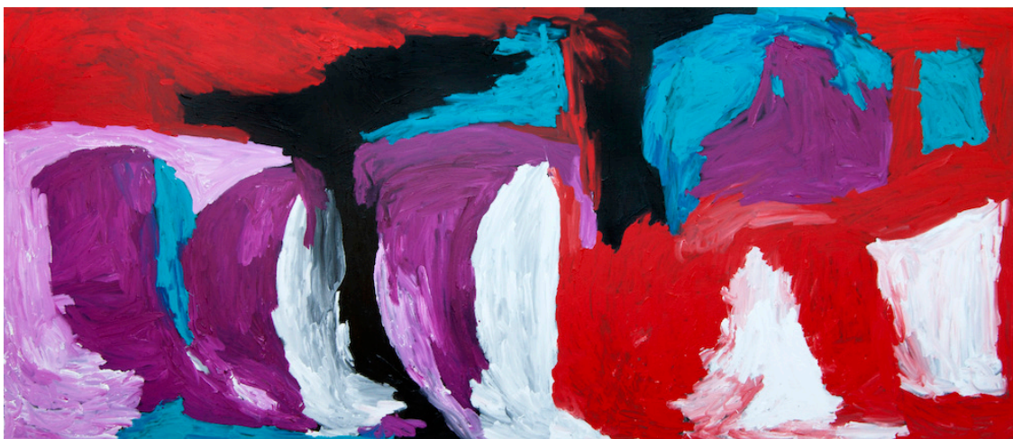
5. MIRDIDINGKINGATHI JUWARANDA SALLY GABORI | Nyinyilki 2011 SOLD by Private Treaty to a Prominent Private Collection in New York by D'Lan Contemporary