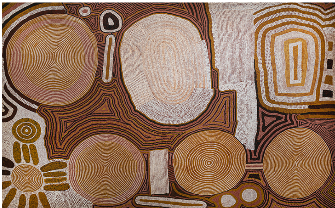
3. TOMMY LOWRY TJAPALTJARRI | Two Men Dreaming at Kuluntjarranya 1984 SOLD by Private Treaty to the Queensland Art Gallery of Modern Art by D'Lan Contemporary